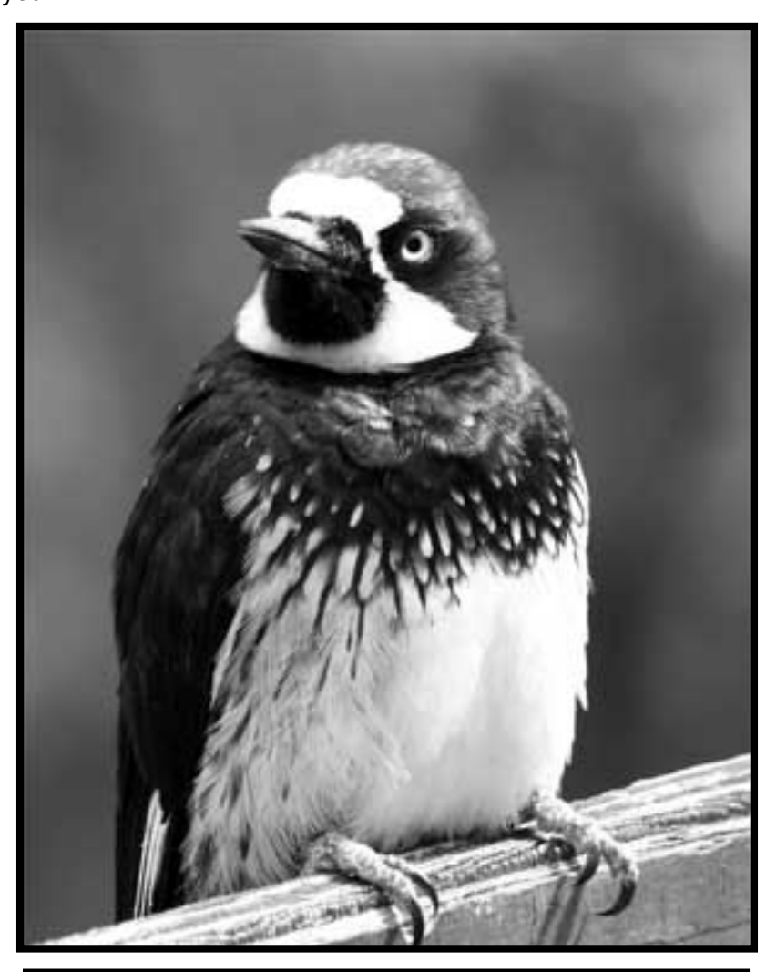
Acorn Woodpecker

Unfortunately, bird populations are on a steep decline. This is resulting in part from widespread construction, destroying amounts of habitat. It is also due to climate change, which is upsetting the migration patterns of the birds. But as humans become more aware of their behavior's impact, we will the opportunity to pursue enlightened choices. In this way humans and wildlife will live together in harmony, and many future generations will be able to enjoy this same spectacular panorama of beauty.